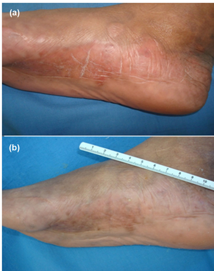
Figure 2 Scleroderma erythema, peeling and fissures remission. (a) Scleroderma plaque with erythema, peeling and fissures. (b) Remission of the signs with a better state of hydration; only residual hyperpigmentation can be observed.

The mechanism of action of pirfenidone on localized scleroderma differs from that observed with other medications, such as topical tacrolimus, mycophenolate mofetil and betamethasone dipropionate/calcipotriol, which have shown effectiveness only in the incipient inflammatory stages of localized scleroderma [14,21-23]. Additionally, pirfenidone has an effect on the development of fibrosis [7,18,20].