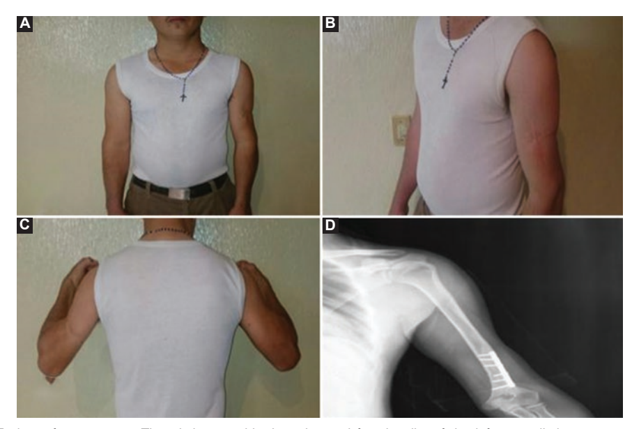
Figure 3. A-C: Patient after 13 years. Though hypotrophic, integrity, and functionality of the left upper limb are present. D: Latest X-ray photography 13 years after surgical repair.

sensory perception and movement of the wrist were evident and complete neurological recovery was achieved at 5 months.